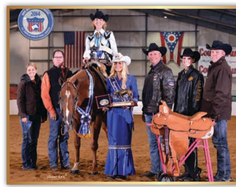
Only A Breeze, owned by Capital Quarter Horses LLC and by Invitation Only, is a multiple AQHA Open and Select Amateur world and Congress Open, Select Amateur and Non-Pro Maturity champion.