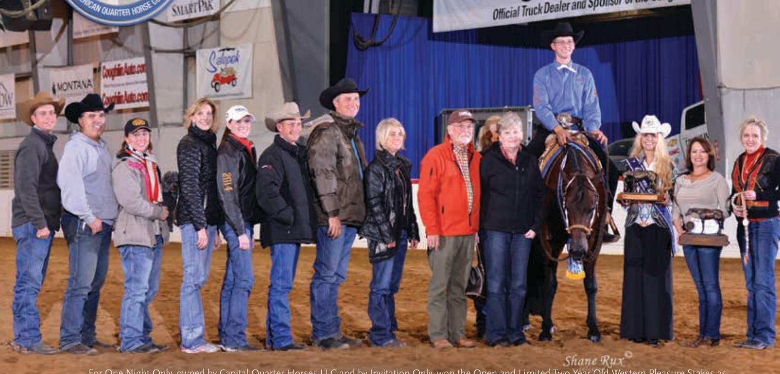
For One Night Only, owned by Capital Quarter Horses LLC and by Invitation Only, won the Open and Limited Two Year Old Western Pleasure Stakes as well as the Limited Non-Pro and Non-Pro Two Year Old Western Pleasure Stakes at the 2014 All American Quarter Horse Congress.

"But on top of that, he's so well conformed. The two most important things to me when I look at a horse are is he taller at the withers than the hip, and does he have short cannon bones, and Invitation Only has both. He has such self carriage and cadence, and a perfect top line, and he keeps that cadence perfect at any speed."