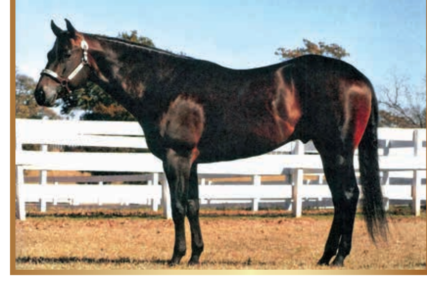
Only In The Moonlite, owned by Rodrock Ranches and by Invitation Only, is a Congress Masters and Three Year Old Western Pleasure champion, NSBA world champion whose get have earned more than $500,000.

Long also admires the longevity of Invitation Only's get. "I think it's great that he had his first foals winning in the Congress Two Year Old Western Pleasure Futurity in 1996,